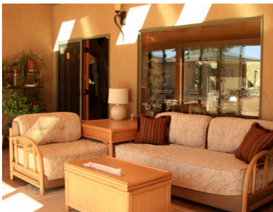
Sun Porch w/ Day Beds