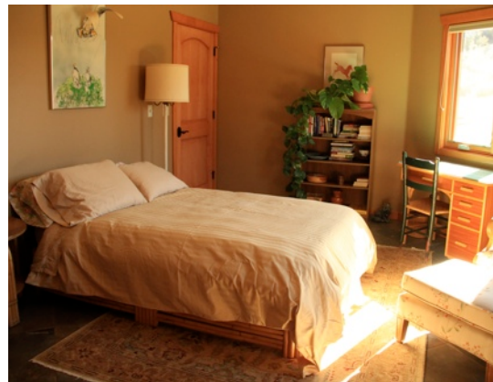
West Wing w/ Private Bath